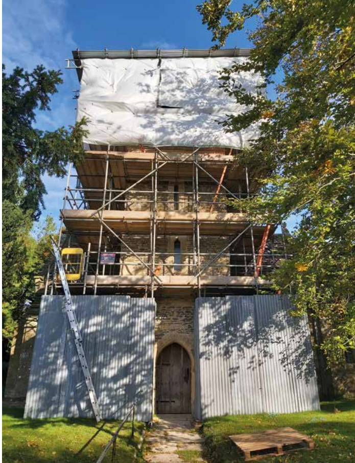
Fifehead Magdalen – tower repairs

The Trust aims to award grants of more than £150,000 every year to help with conservation, restoration, installation of facilities and repairs. This is more than we receive in income from our fundraising activities which is why we need your help.